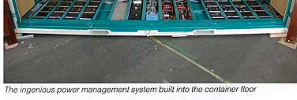
The ingenious power management system built into the container floor

intelligent. This system will monitor the functioning of every device, the energy balance and the weather. On the base of this information, it will make a prediction about the future energy balance and take the necessary actions. Sensors will collect this data and for evaluation purpose it will be available online.